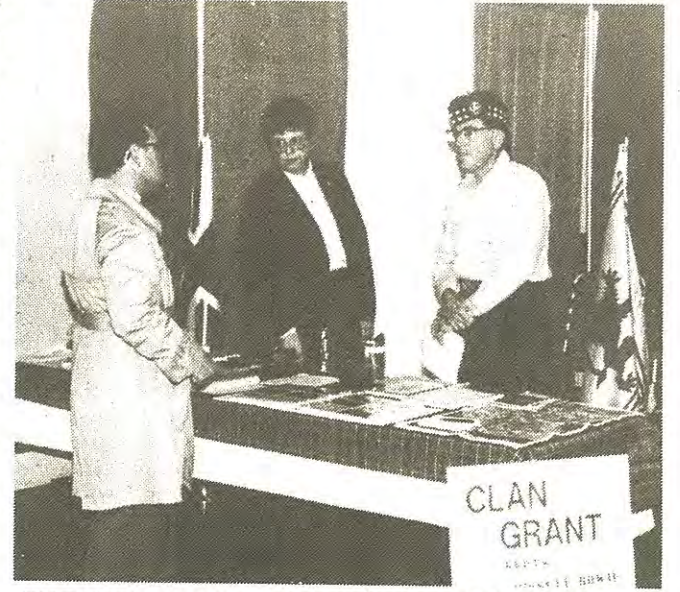
WORKERS AND VISITORS at the Santa Clara, Calif., event are pictured above March 15-16.

"Volunteers are desperately needed for most of the Games. Last year at Santa Rosa, three of us managed to keep the booth going but it was difficult. At Fresno, there was only myself which meant taking down the display every time I had to leave the booth. As the display grows, this becomes more time-consuming. If you could donate an hour or even less, let me know which Games you plan to attend. I am including a list of the Games in Northern and Central California with the ones where we plan to have a booth marked with a star "★."