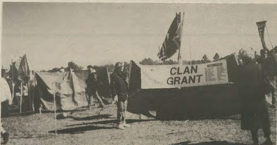
Jacksonville, FL--February 1996