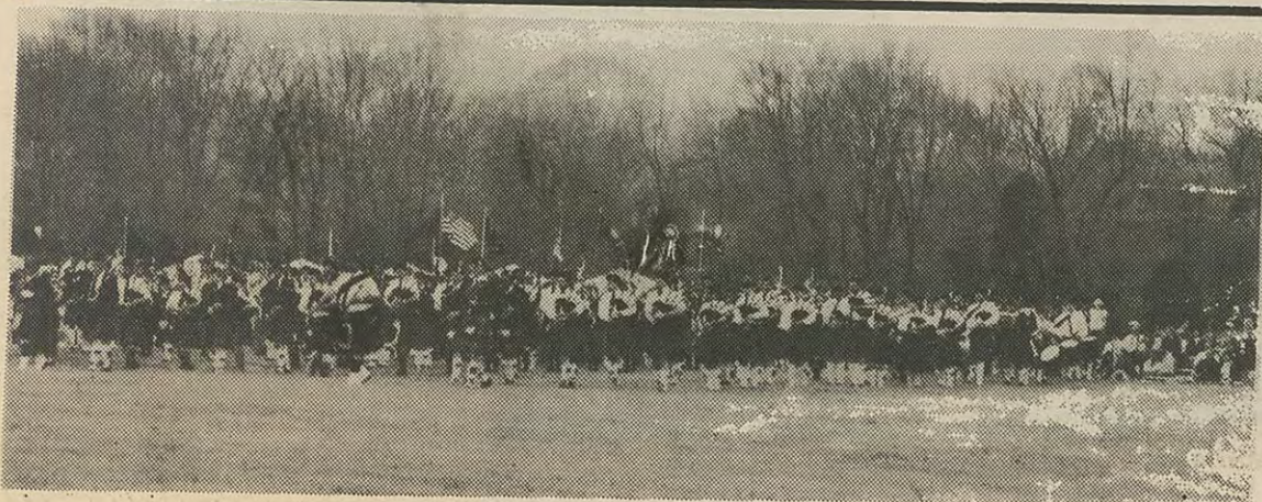
Massed Bands at the Norman Highland Games April 1996