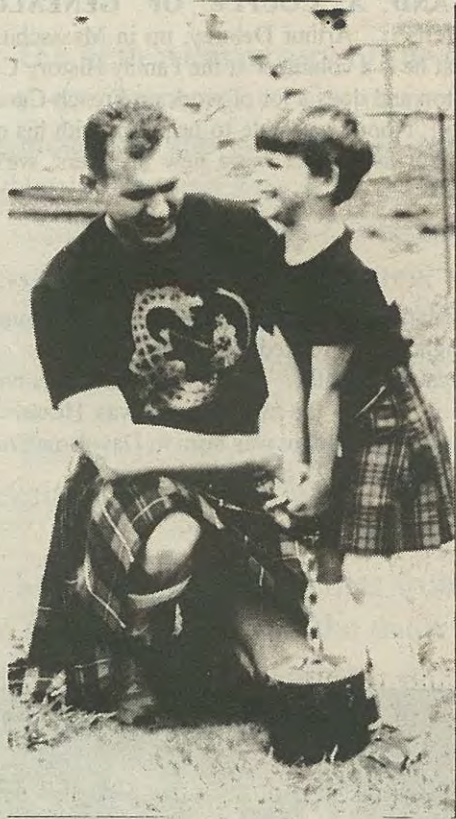
A wee lad tries his might!