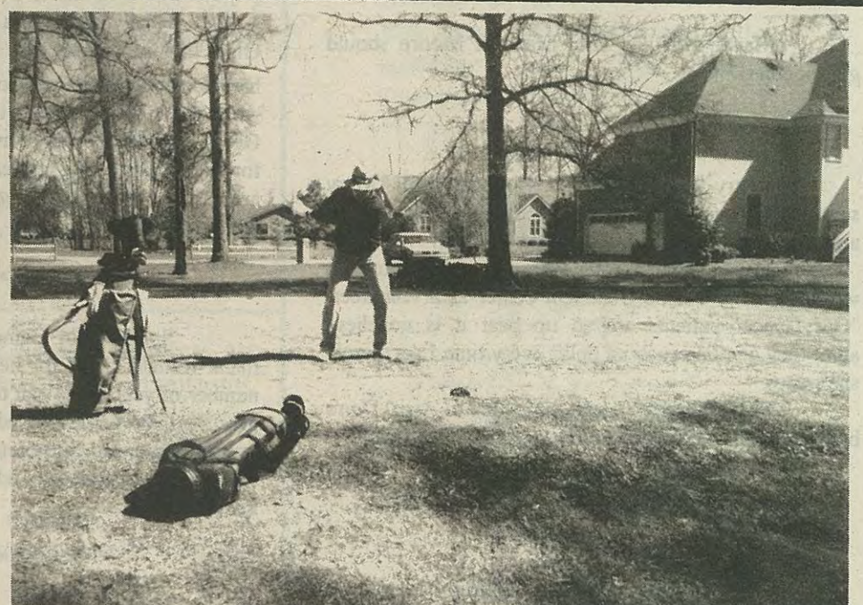
Has anyone seen the editor?

Should we fail to secure the required 10 subscribers, I will return the payment to you but I do not anticipate that happening.