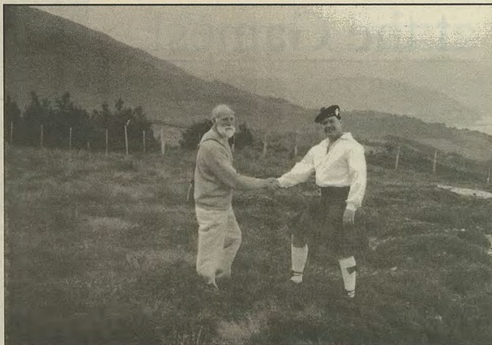
Member Buys Piece of Scotland!