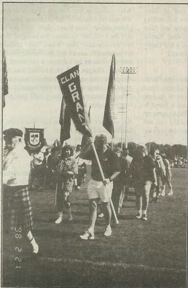
The parade of Clans at the Jacksonville games