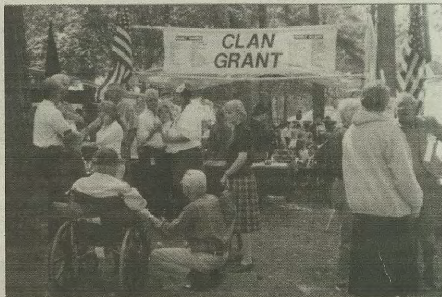
Grants gathering in front of their tent at Stone Mountain.

Thanks to Allen Grant for providing the following photos: