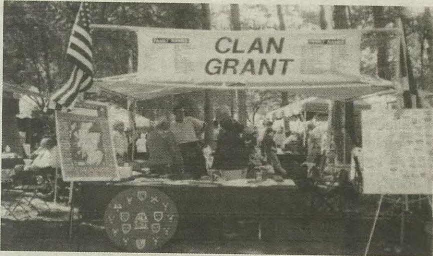
Another view of the Grant tent at Stone Mountain.