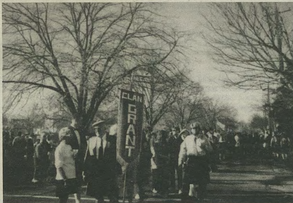
Clan Grant on the march... or walk as the case may be.