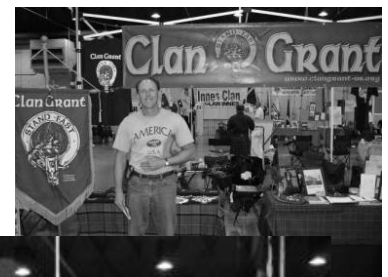
Photo below is Clan Grant tent representing at Pomona Highland Games, CA