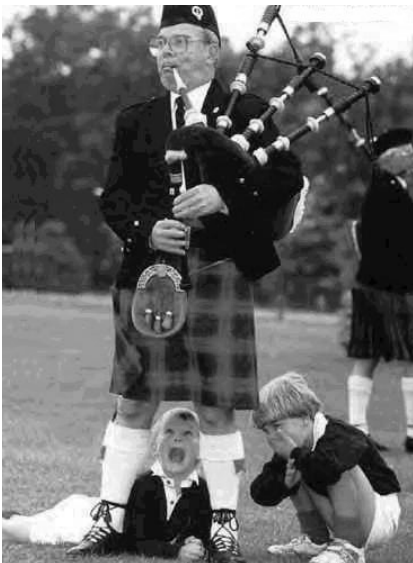
Above photo circulated on the internet is too cute not to publish. Kudos to the photographer!

-500 degrees - Hell freezes over. Scottish people support England in the World Cup!