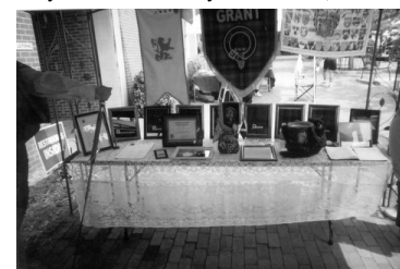
Grants are honored Clan!