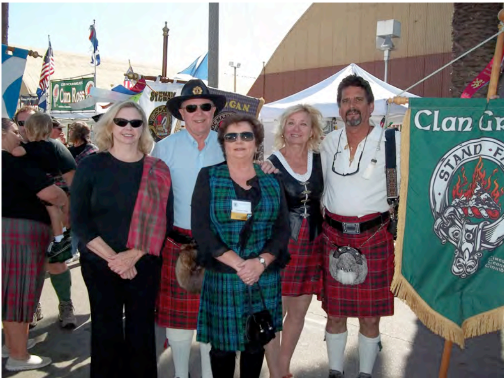
Some of the AGM attendees

12725 Home Farm Dr. Westminster, CO 80234 jclick@msn.com (303) 513-1178